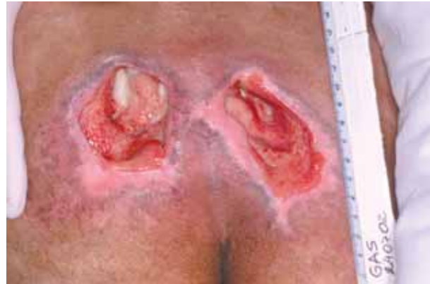
Figure 8. Initial clinical aspect of the sacral ulcers