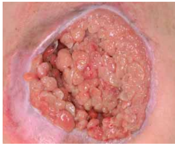
Figure 4. Filling of the cavity with exuberant granulation tissue reaching the skin margin after two months of treatment

measuring 5.6 x 6.4 cm on the left and 6.6 x 8.0 cm on the right (Figure 8), both about 3 cm deep. The ulcers had a clean bottom and no necrosis or signs of infection and were submitted to various anti-sore treatments without a satisfactory response.