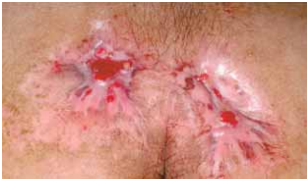
Figure 9. Filling with granulation tissue accompanied by re-epithelialization of the ulcers after two months of treatment with the natural biomembrane.