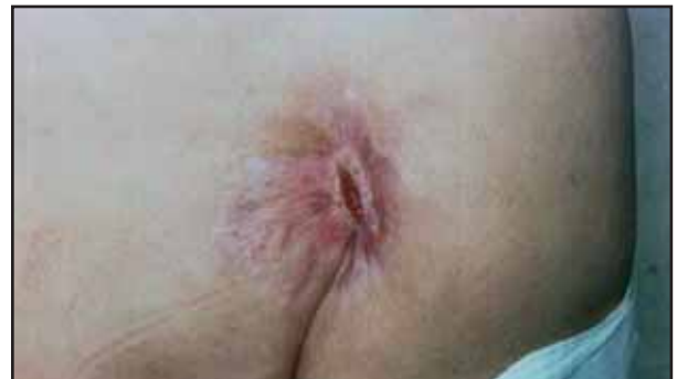
Figure 6. Reduced ulcer size after 5 months of treatment.