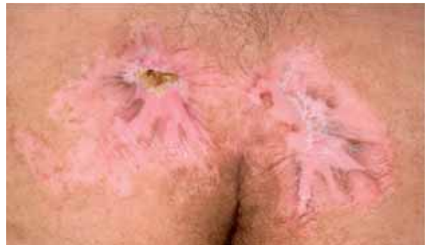
Figure 10. Full ulcer healing without retraction or bulging after 4 months of treatment with the natural biomembrane.

The natural biomembrane favored intense exudation at the beginning of treatment, an event that appears to be related to its action on vascular permeability, facilitating rapid wound debridement, as visualized by the reduction of necrosis and fibrin (Figure 2).