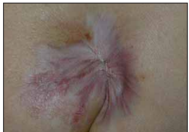
Figure 7. Scar level with the skin and total re-epithelialization of the ulcer after 6 months of treatment..