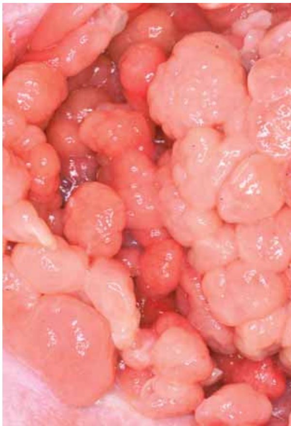
Figure 5. Close up view of granulation tissue.

The authors report two cases of pressure ulcers of chronic evolution that had not responded to various treatments until they were submitted to dressings with the biomembrane.