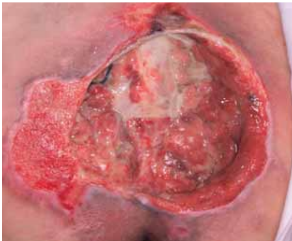
Figure 3. Ulcer showing a reduction of fibrinous-necrotic tissue.