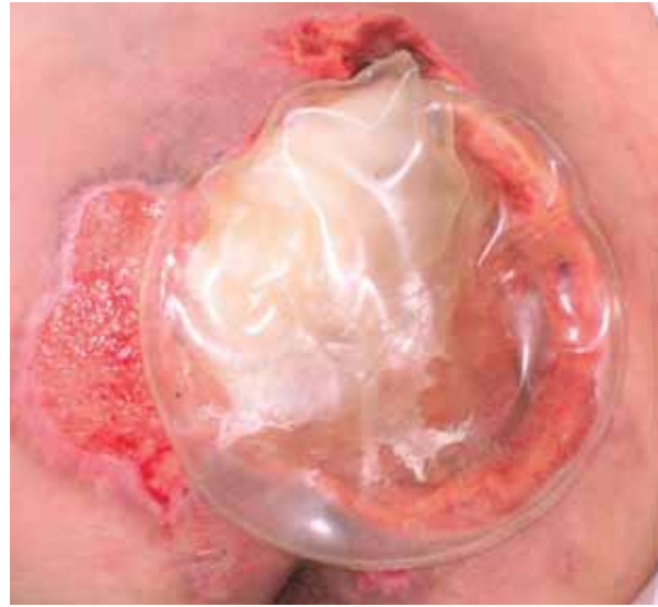
Figure 2. Application of a natural biomembrane dressing.